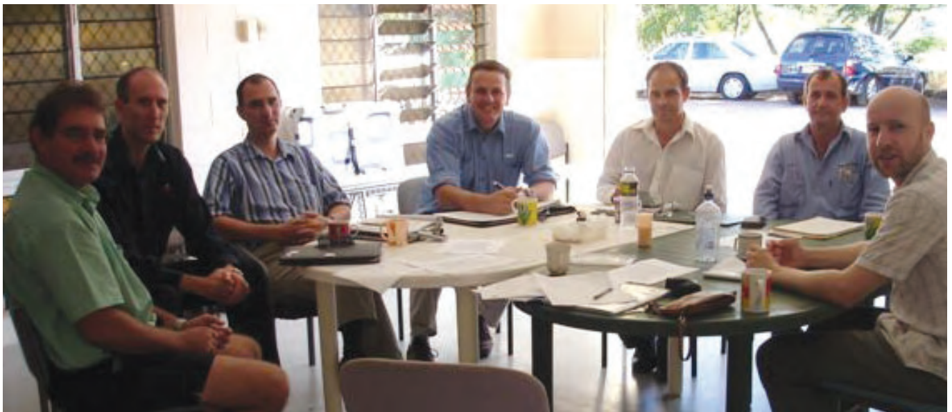
A meeting of the Energy & Water Focus Group